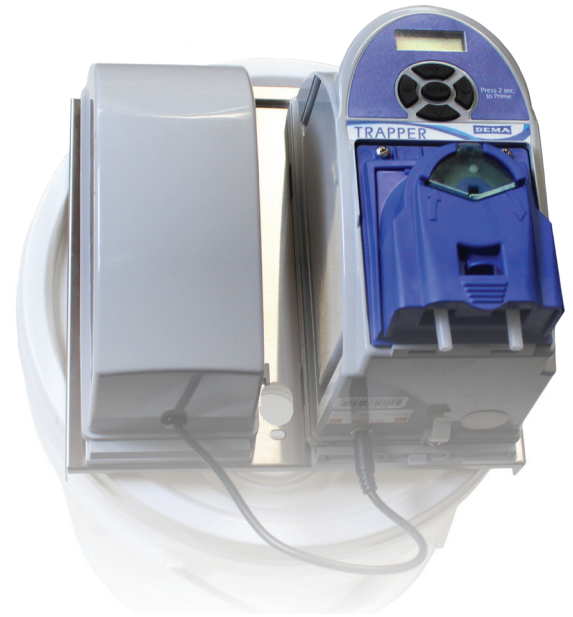
Trapper DC with Pail Bracket