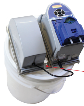
Available for battery version only 2507B.E.P shown pail and lid not included

P = Pail bracket for use on 5 gal bucket**