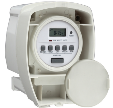
Squirt's enclosed back and rubber boot protects timer from tampering and the environment