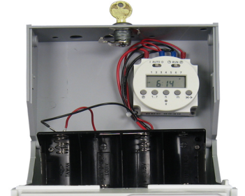
Drain Chief's battery pack nests inside locking, splash resistant cabinet